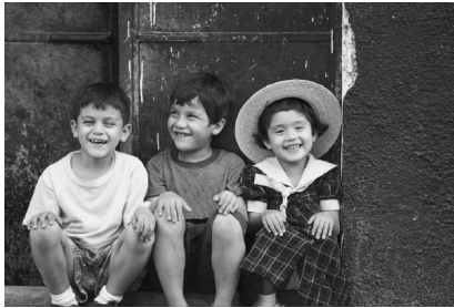
Future Zuri Color Studio Clients